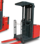
▲ CDG500 with Forks