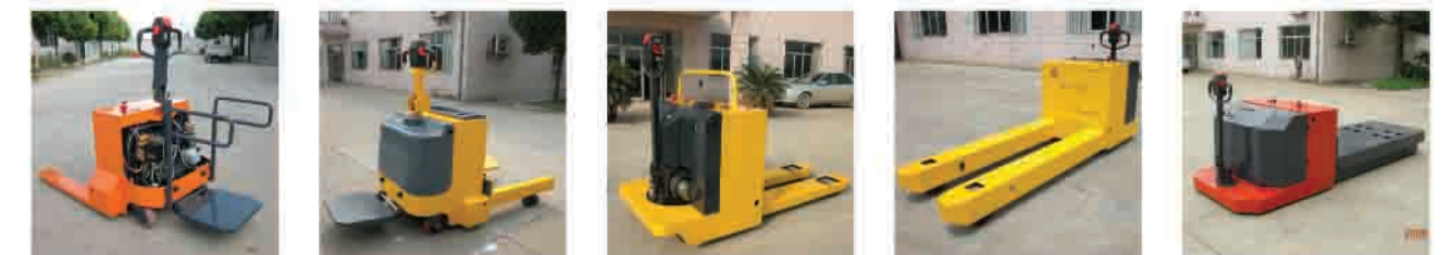
With protection bar and stand on platform. Special design for moving drum. 3Ton heavy duty walkie pallet truck. 6Ton heavy duty pallet truck. 10Ton heavy duty power truck.