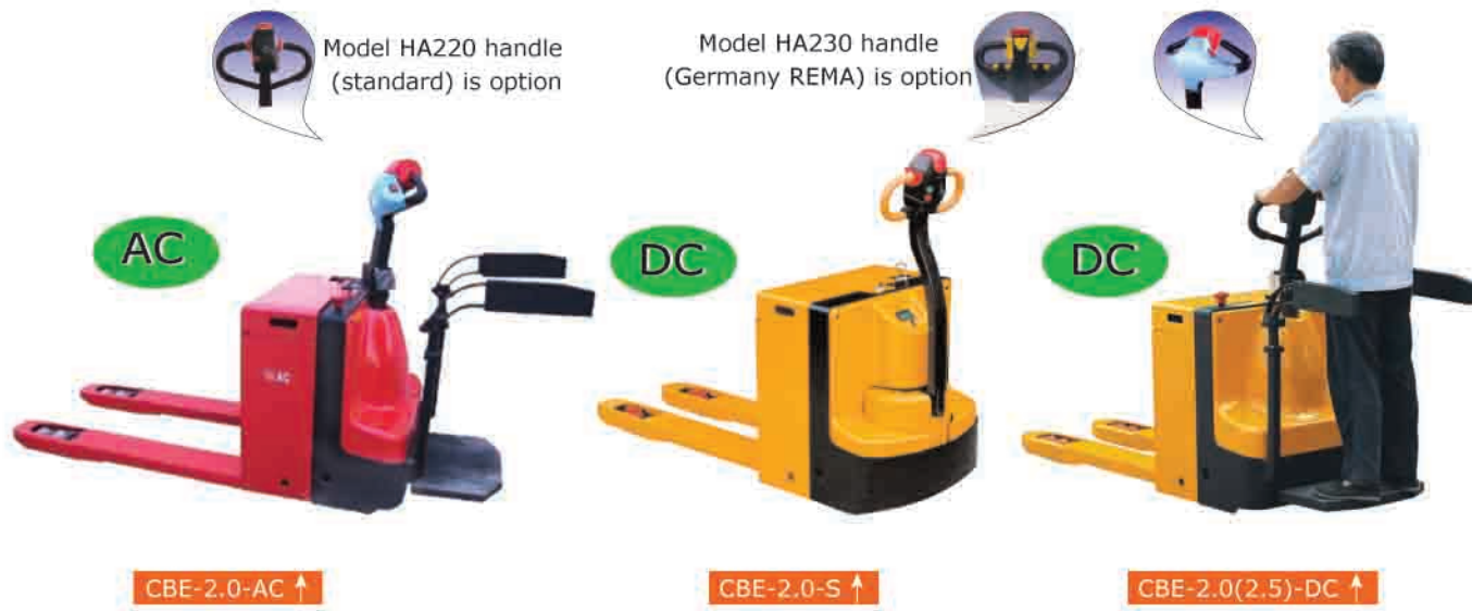
Model HA220 handle (standard) is option